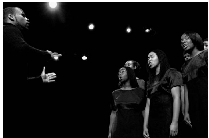
Mosaic Singers. Photo from the report: “Excellence on Stage and in Life: The Mosaic Model for Youth Development Through the Arts.”