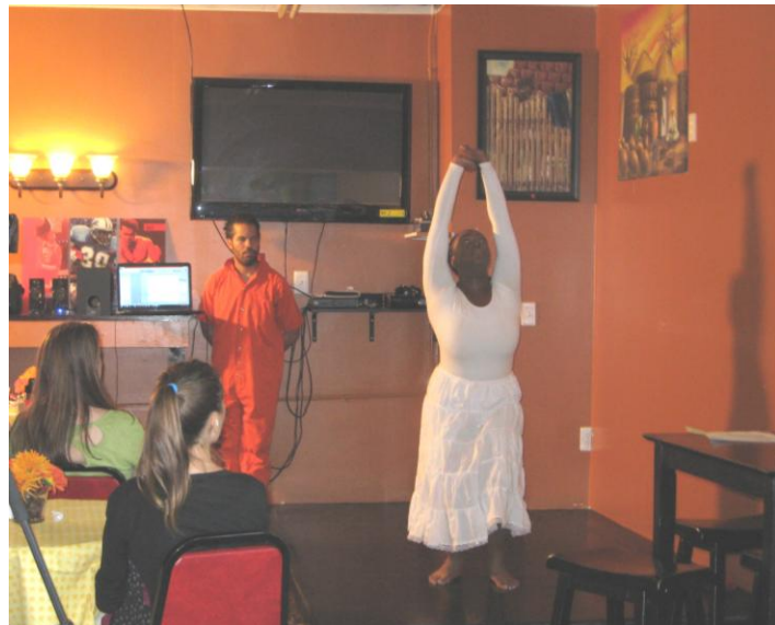
Cell/Ships, a performance by 4TheatrSake at Urban Word

Her presence is as main character in a production titled " Cell/Ships, " presented by the Detroit-based drama troupe, 4TheatrSake, as a critique of the prison system. It's a fitting piece for the Network of