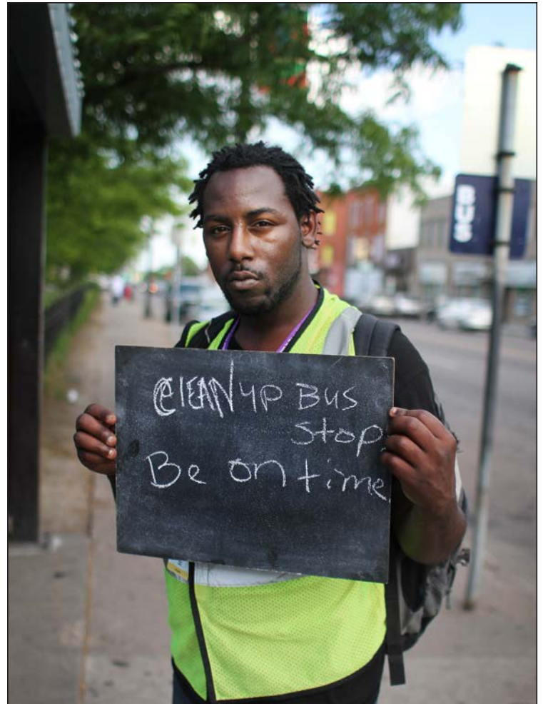
Above: A community member shares his suggestions for improving the neighborhood on the Traveling Chalkboard.