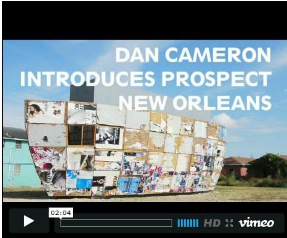
Prospect New Orleans video

Gulf region, has been funded since 2009. Similarly, the DAF is a long-term supporter of the Ashé Cultural Arts Center , an artist-founded community development agency and 18,200 facility “designed to utilize culture to foster human development, civic engagement and economic justice in the African-American community.”