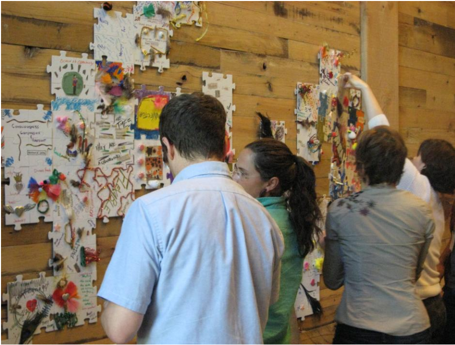
The Opportunity Agenda's Creative Change retreat, 2011

into the newer direction and the harder questions and it doesn't tell us a lot about ourselves and our practice."